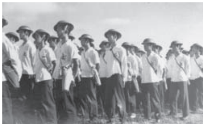
VVV report for duty at Schofield Barracks