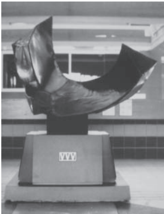
VVV Memorial artwork at University of Hawaii, Manoa