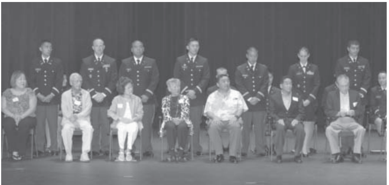
Family members on stage to accept honorary degrees for VVV who died in WWII

This story of the seven 442 nd soldiers began on December 7, 1941, when Pearl Harbor was bombed by the Japanese naval forces. As members of the ROTC program they were called out for duty and subsequently mobilized in the Hawaii Territorial Guard. After six weeks, they and all others of Japanese ancestry were “booted out” from