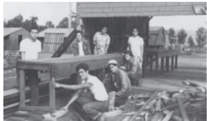
VVV at work at Schofield Barracks