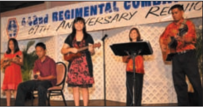
Entertainment by students of Roy Sakuma Ukulele School