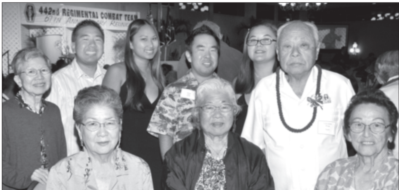
RHQ Chapter members at 67th Anniversary Banquet