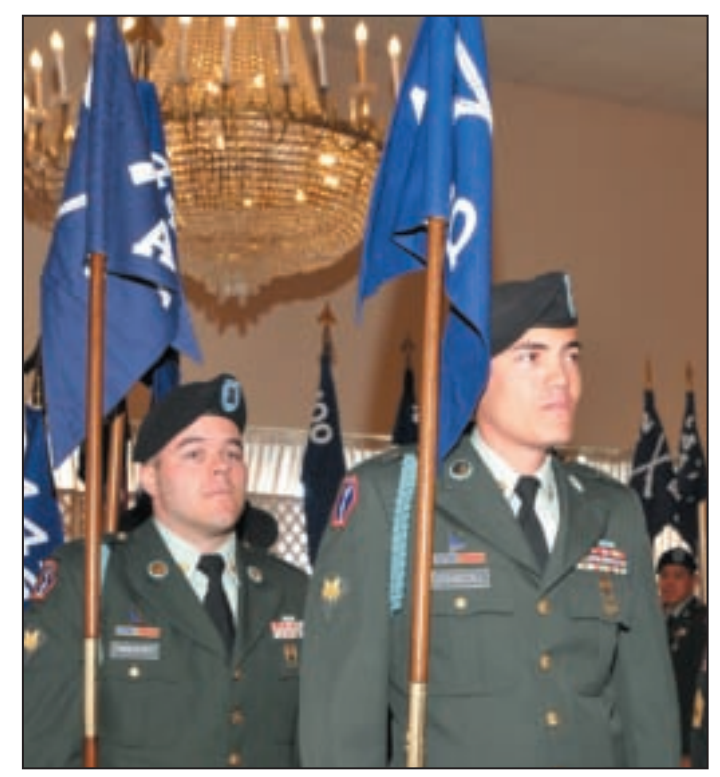
Reservists prepare for 442 RCT guidon procession