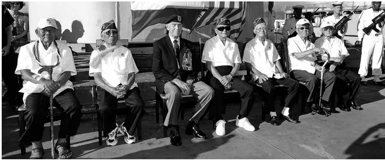
Seven recipients of the Legion of Honor