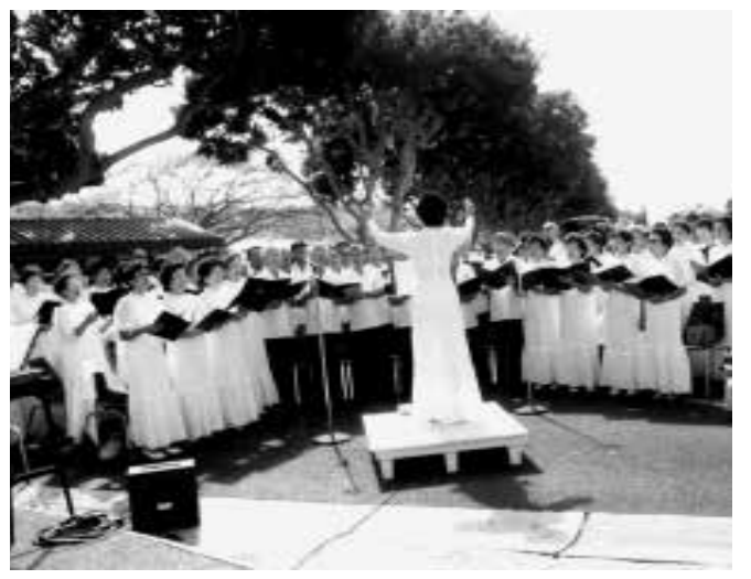
Uta No Kai performing at a Memorial Service