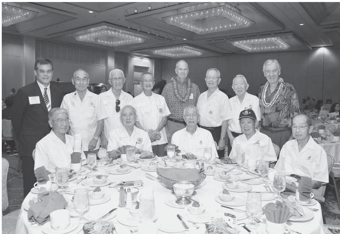
Chamber of Commerce of Hawaii Military Recognition Luncheon held at Hilton Hawaiian Village, May 19, 2011