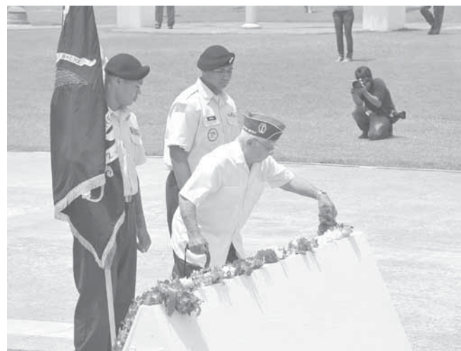
Memorial Day photos taken at Punchbowl and Hawaii State Veterans Cemetery