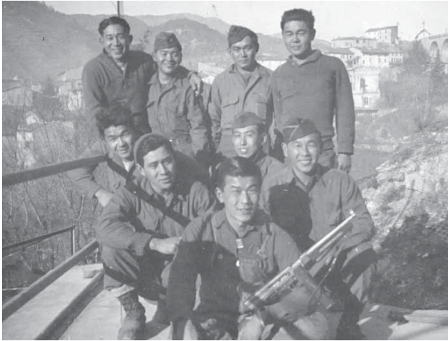
HQ 3rd Bn Wire Squad