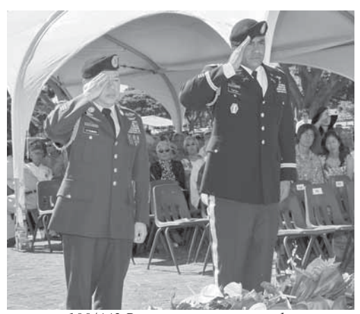
100/442 Reserve presents wreath