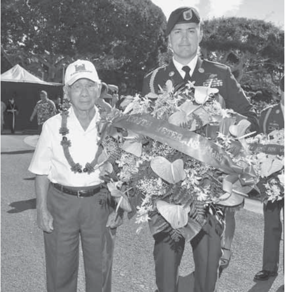
1399 presents wreath