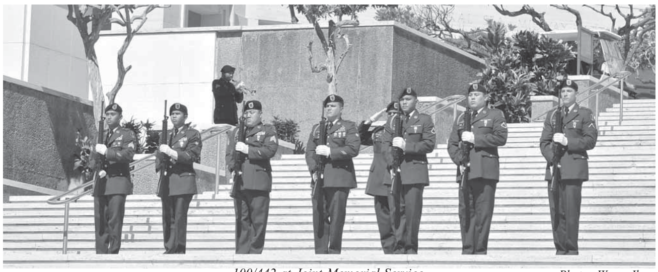
100/442 at Joint Memorial Service