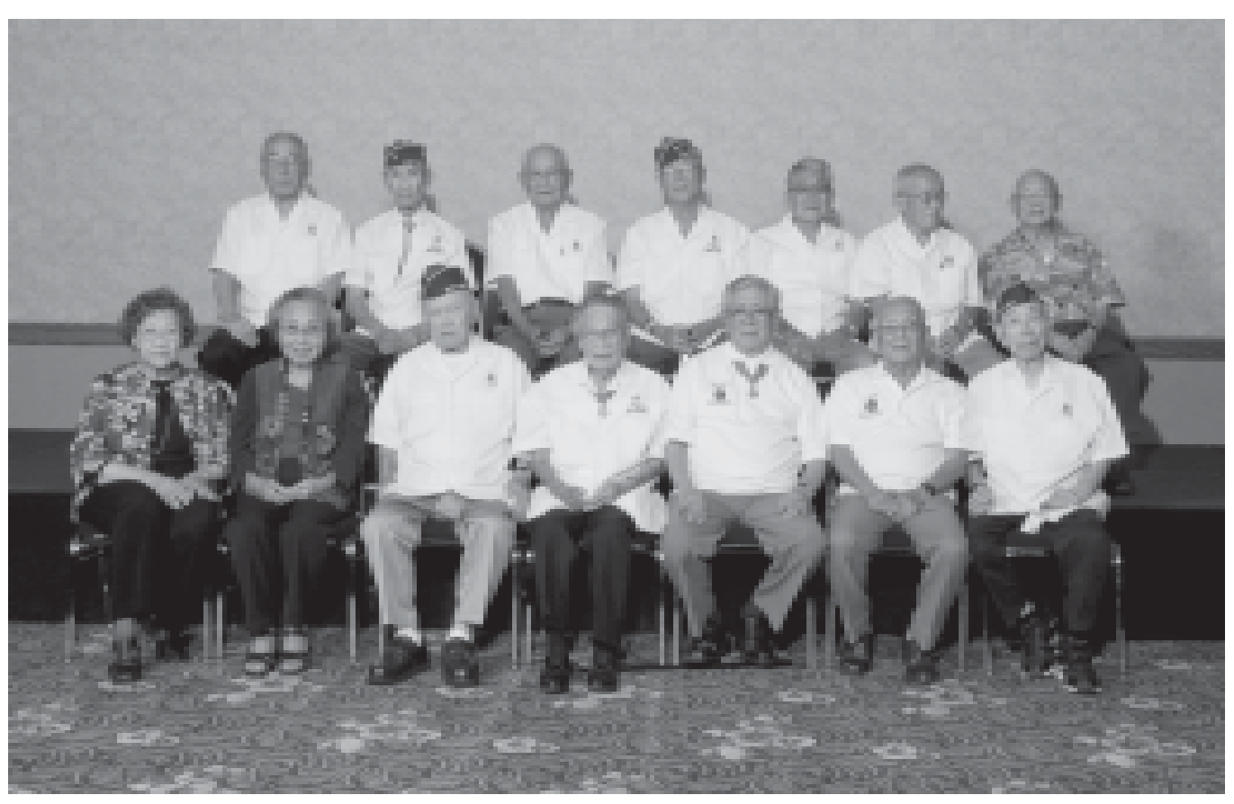
E Company, 442nd Regimental Combat Team