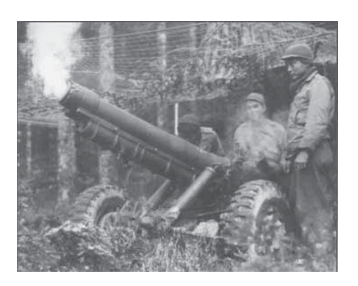
"Go For Broke"

Fremont Hotel Las Vegas, Nevada May 3 – 7, 2012