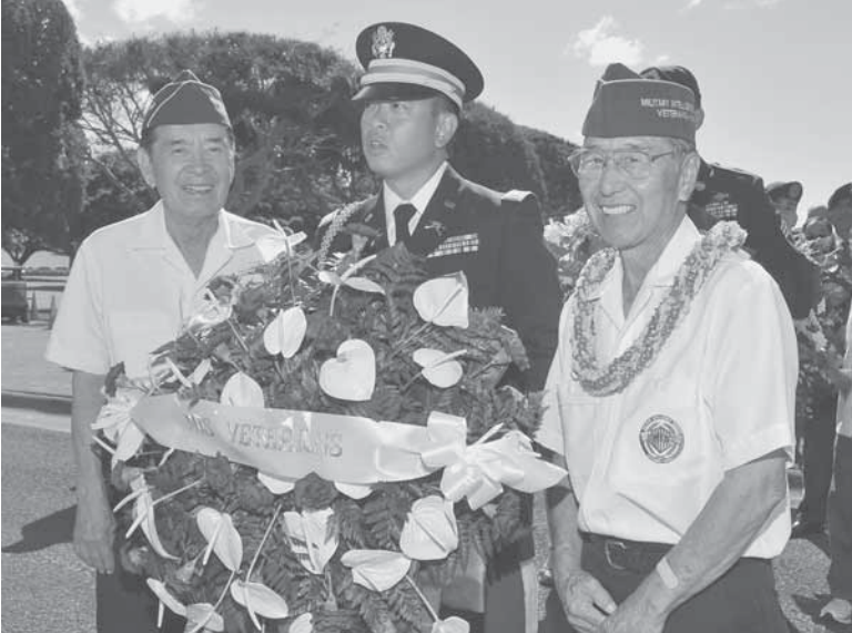
MIS presents wreath