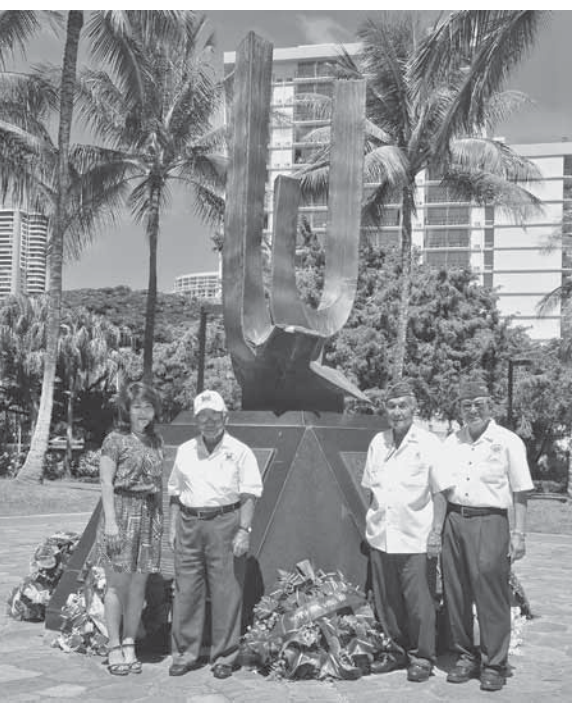
Group poses in front of Brothers in Valor Monument