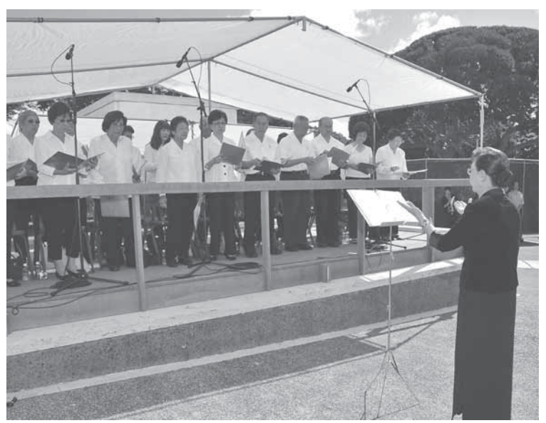
Honpa Hongwanji Betsuin Choir