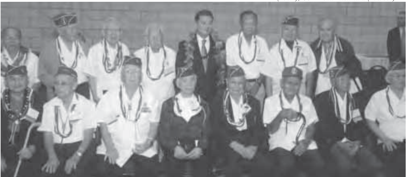
Gen. Eric Shinseki poses with veterans