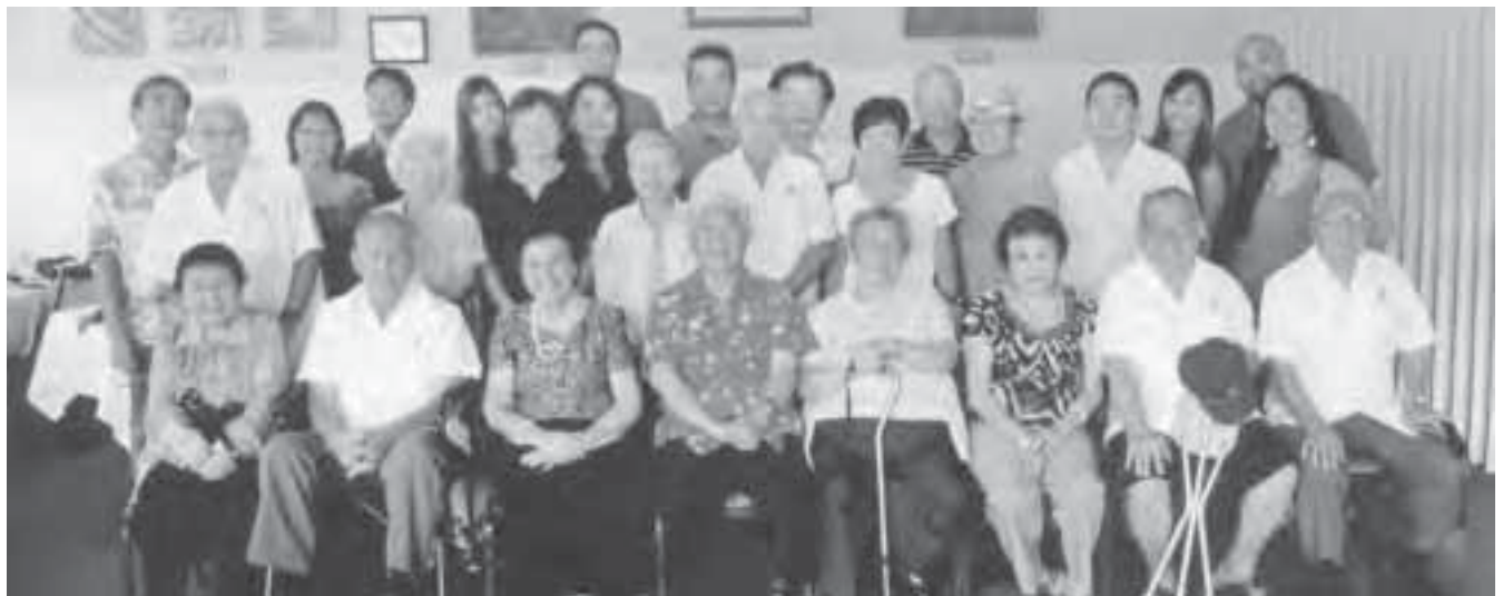
RHQ Chapter annual meeting gathering on Oct. 16, 2011.

"May all your troubles last as long as your New Year's resolutions." — Joey Adams Arrivederci!