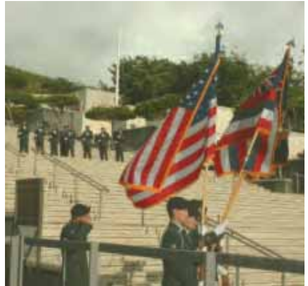
100th/442 Reserve Color Guard