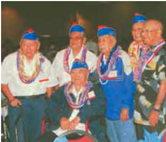
E Co. Veterans