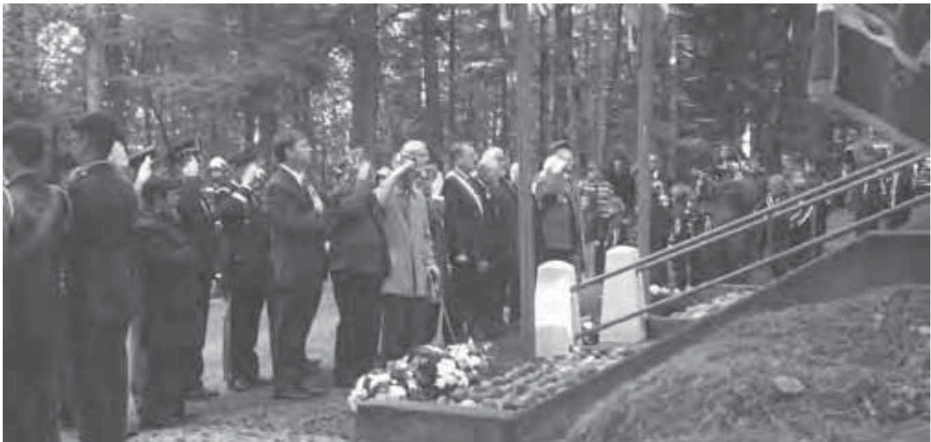
Ceremony at Bruyeres

Japanese American Living Legacy is a nonprofit (501c3) organization based out of California State University, Fullerton. All of the board of directors, staff and advisors are volunteers. For more information on Japanese American Living Legacy, please visit their website at www.jalivinglegacy.org or call them at (657) 278-4483.