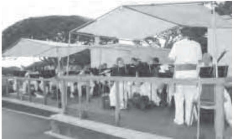
Royal Hawaiian Band