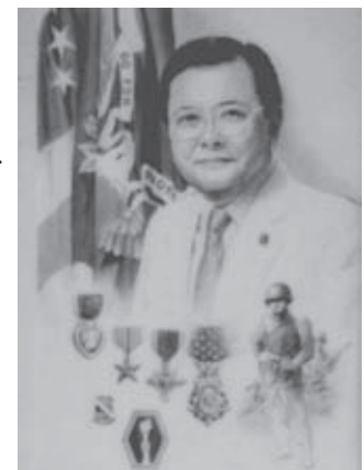
His motivation of constantly reminding us of those cultural values relating to ancestral roots.