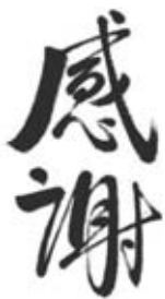
His calligraphic design of our KANSHA award