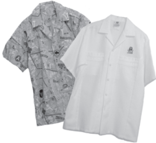
Design of special colorful Aloha shirt and the formal 442 nd veterans shirt worn at functions of the 442 nd Veterans Club and at events where the 442 nd veterans are invited guests.