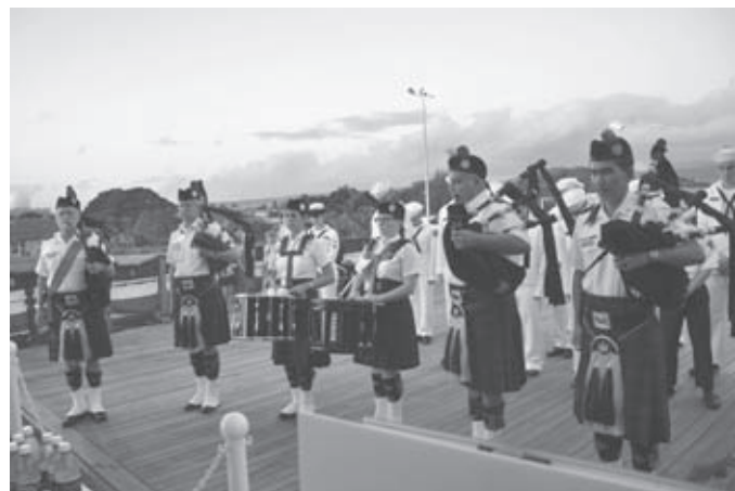
Celtic Pipes and Drums