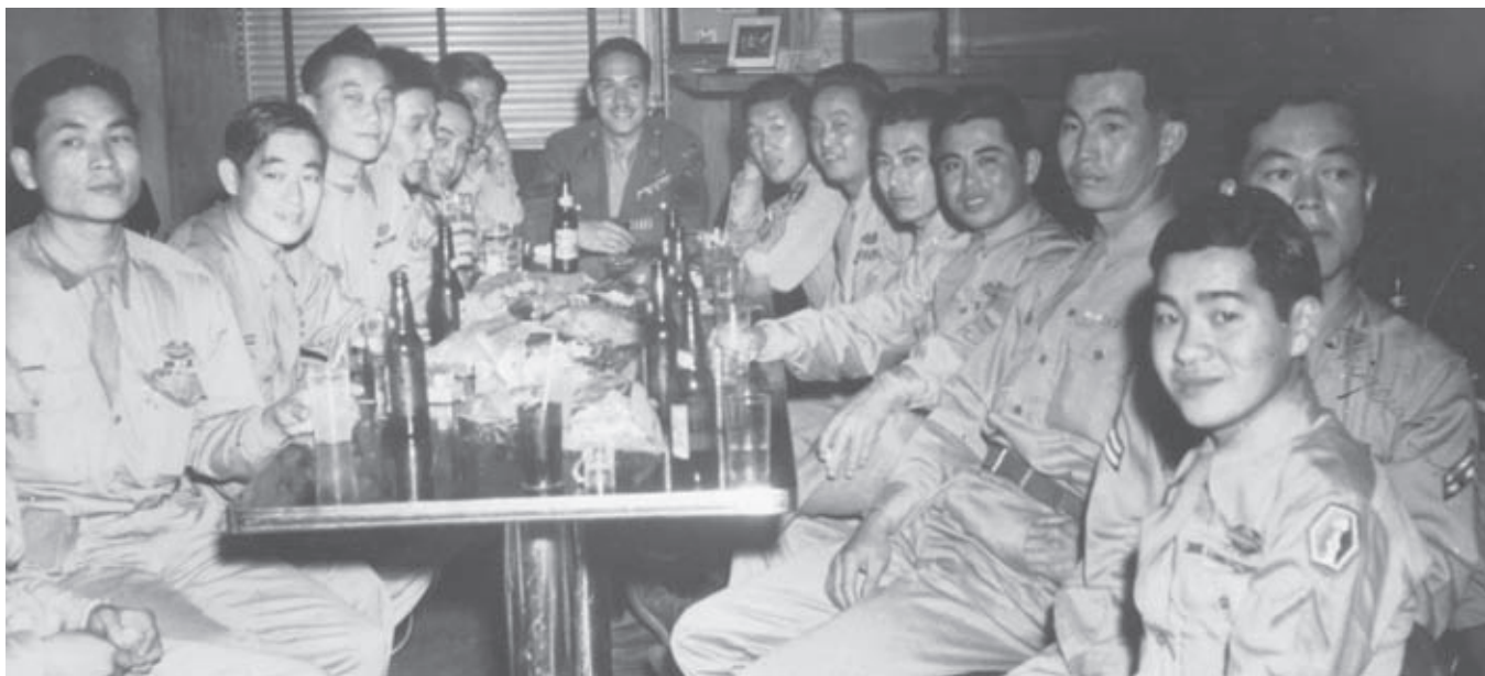
The Furlough Group