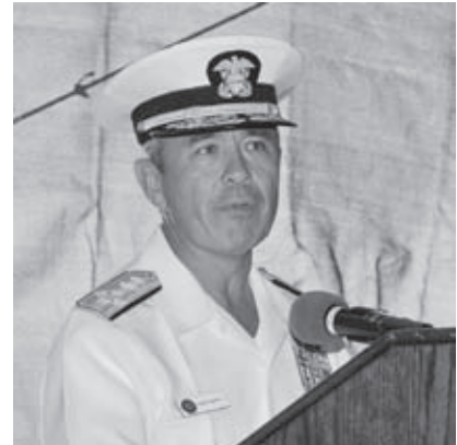
Adm. Harry B. Harris, Jr. (Cdr., US Pacific Fleet) makes keynote address